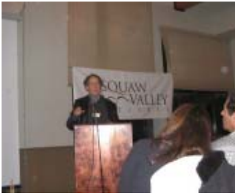
Dr. Stephen Schneider discussed global warming and politics at an Institute event in January at Plumpjack Squaw Valley Inn

“The World Politics of Global Warming” was the title of Stanford University Professor Stephen H. Schneider’s talk on January 14, 2005.