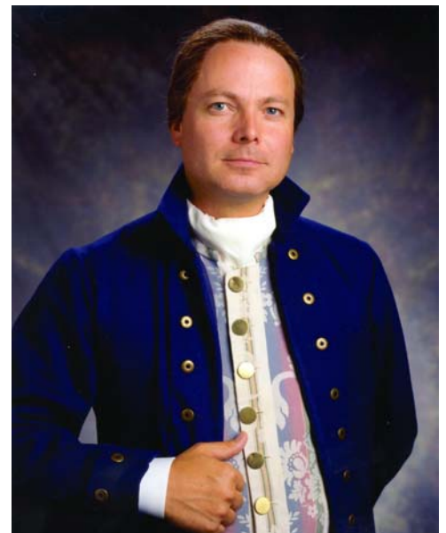
Thomas Jefferson and John Adams to visit Squaw Valley - story on page 4

This event was co-sponsored by PlumpJack Squaw Valley Inn, who generously donated the use of their Conference Center space.